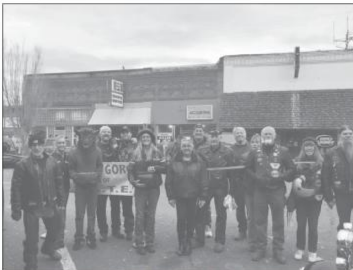
Columbia Gorge Chapter at Trunk-or-Treat; photo Micki Robinson

Well, that's it from here. Until next time y'all take care and be safe. ◇