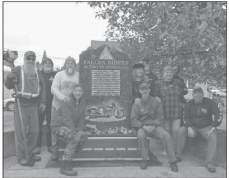
Some of the Tacoma Chapter clean-up volunteers