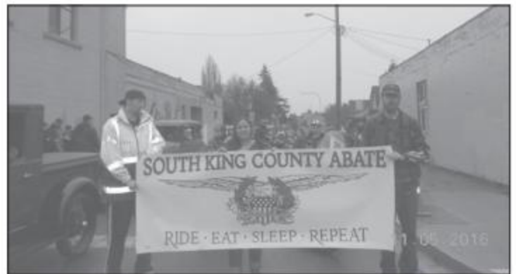
South King County Chapter in the Auburn Veterans Day Parade

Be safe out on the roads, it's starting to get slick in spots, and have a great month. ◇