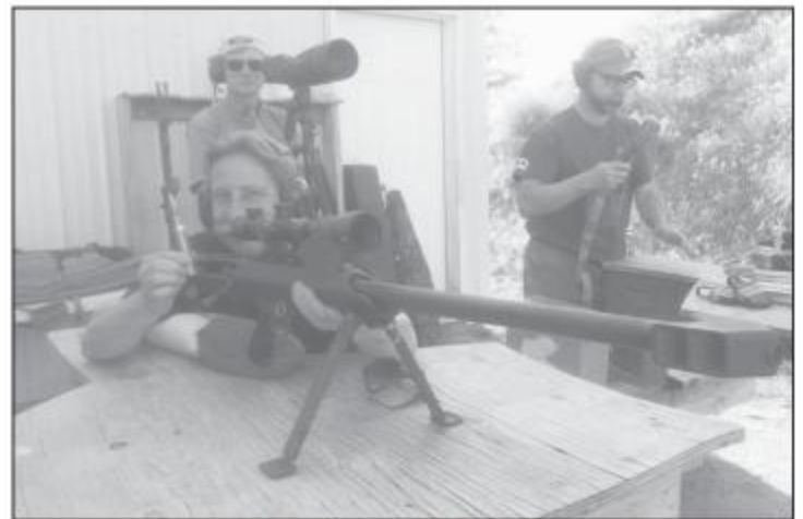
Highwayman with a .50 cal