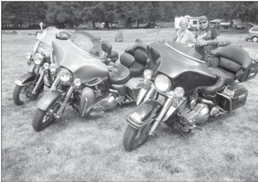
Dick Mapes Bike Show Touring Class

Until next month, ride safe and often. JL